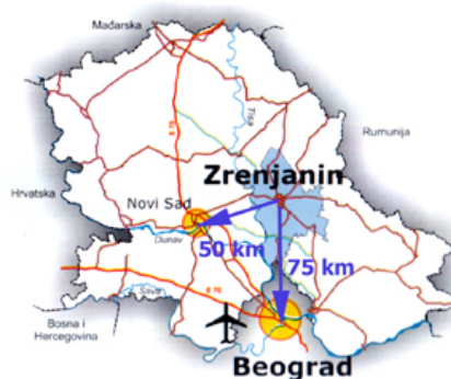
Airfield Map: ARADAC (45.25°N, 19.84°E)